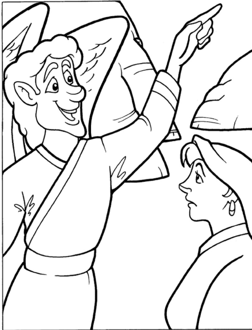
"He is not there, he is risen" Mark 16:6