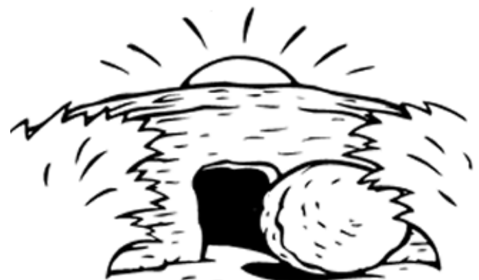
"He has risen! He is not here." Mark 16:6